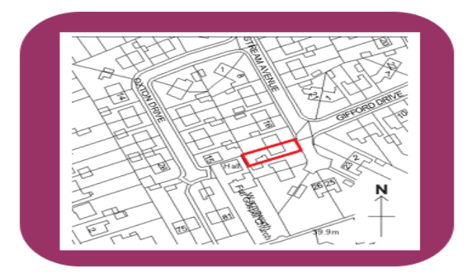
Why do I need to submit a Site Location Plan?

The site should be outlined in red and any adjoining land in your ownership should be outlined in blue.